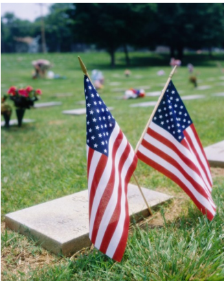
Veterans Day November 11

The next meeting of the GVE Board is November 19, 2:00 PM at the Jacaranda Library.