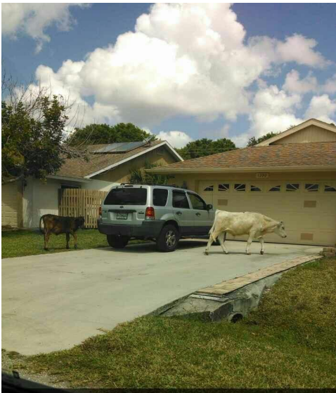
Just strolling thru the neighborhood

Two young bulls surprised residents last April by exploring in a more personal up close way, perhaps checking out the purchase of a new car or a deal on a new home?